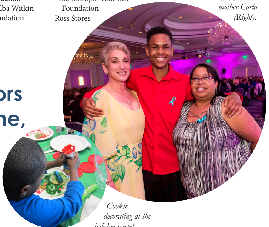
Cookie decorating at the holiday party!

75% of SFCASA high school seniors graduated on time, 50% higher than the statewide graduation rate.