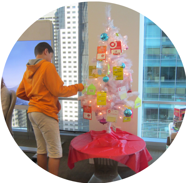
One of our foster youth picking out his bingo prize at our annual youth holiday party. Bingo is always a popular game!